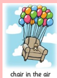
chair in the air

Double letters in words (e.g. rabbit) are also called 'digraphs' - two letters making one sound.