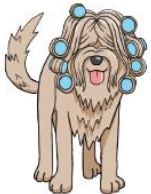
curl the fur