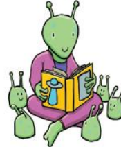
get near to hear

Make an 'o' with your mouth then move your lips out as you say oi oi oi