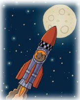
zoom to the moon