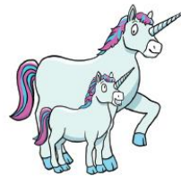
born with a horn

Open your mouth wide, push your tongue down and say ar ar ar