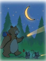
march in the dark

Pucker your lips and keep them small as you say oo oo oo