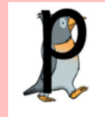
Down the penguin's back, up and around its head.

For each grapheme we learnt its corresponding phoneme (sound); 's' as in sock, 'a' as in ant, 't' and in toast and 'p' as in peg. We practised saying pure sounds, to avoid adding an 'uh' sound at the end.