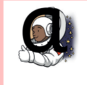
Around the astronaut's helmet and down into space.