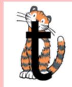
Down the tiger and across its neck.