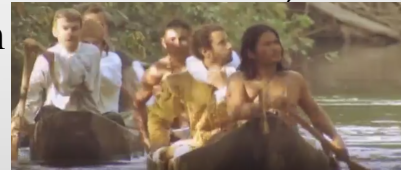
A modern recreation of Tudor travel in the rainforest.