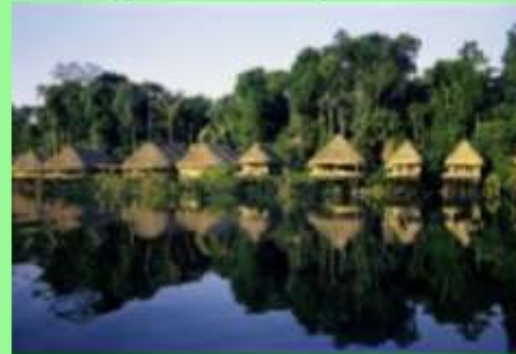
Living beside the Amazon River