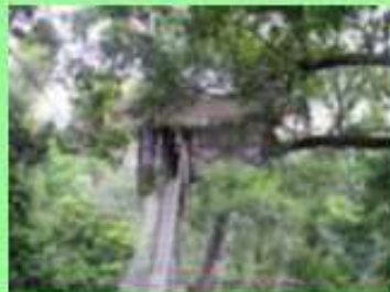
A treetop dwelling