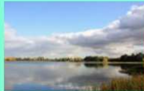
A lake in the reserve