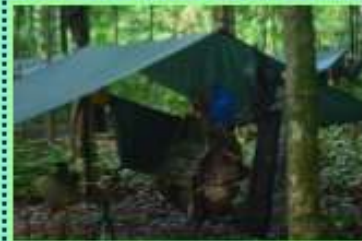
A village in a rainforest clearing